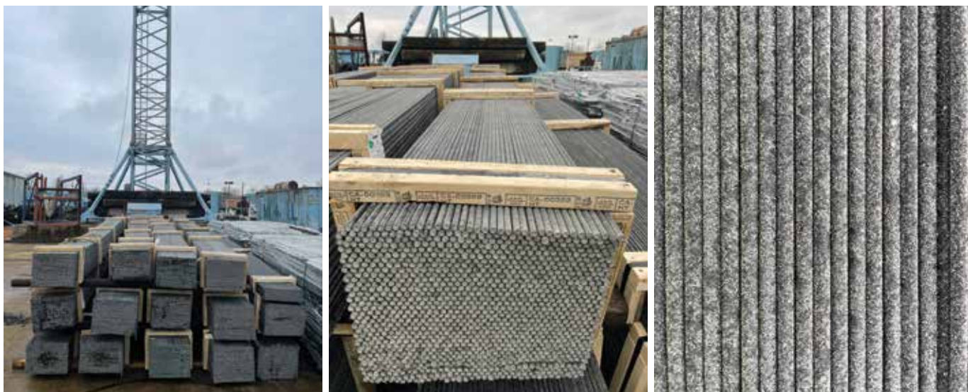
Fig. 1: BFRP bars used to reinforce topping slabs

The design of the topping slabs was performed according to ACI 440.1R-15, Section 13.2, even though it is recognized