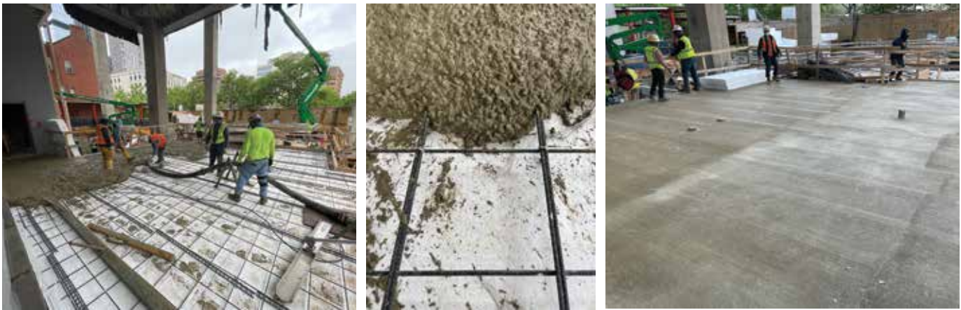
Fig. 5: Concrete placement for one of the topping slabs

Inman et al. 17 conducted a study on the mechanical and environmental assessment and comparison of BFRP and steel bars in concrete beams. The life-cycle assessment (LCA) results showed that the BFRP-reinforced beams performed significantly better across all 18 environmental indicators evaluated in the study (including ozone depletion, acidification, and eutrophication) compared to the steel-reinforced concrete beams. In terms of global warming potential (GWP), a reduction of 62% in climate change emissions was inferred when using BFRP reinforcement over conventional steel. 17 This would make BFRP a green solution for concrete reinforcement.